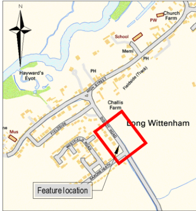
SITE LOCATION Scale 1 in 10,000 @ A3